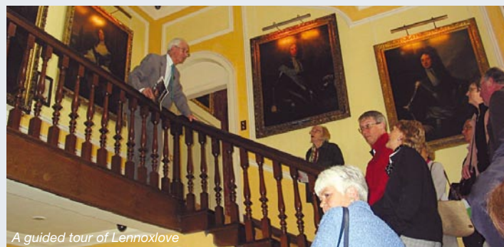
A guided tour of Lennoxlove