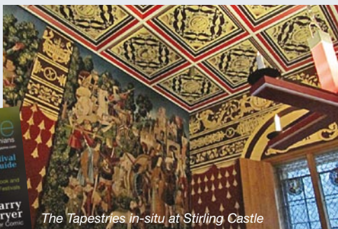
The Tapestry in-situ at Stirling Castle

Neil Hynd was on hand to illuminate a very special preview of the Royal Palace at Stirling Castle , not to be opened to the general public for another few weeks. 49 members were thrilled to see the beautifully restored and painted rooms where the Hunt of the Unicorn Tapestries will hang. The Church of the Holy Rude, the first to be recorded by NADFAS in Scotland, was also open to view.